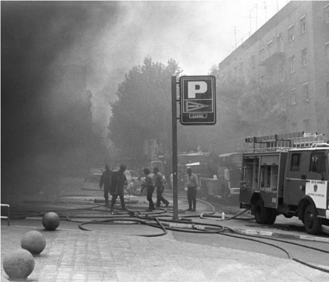
Firefighters try to access the interior of the Hipercor shopping centre carpark after an ETA attack (Barcelona, 19/06/1987).

At the beginning of the 1980s, democracy was consolidated in Spain. With it, a path of European integration and economic, social and cultural modernization began. But it continued to face different terrorist threats.