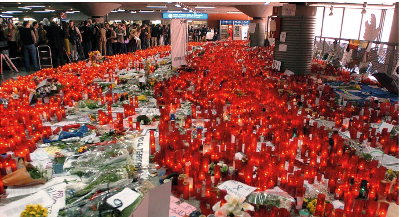
In memory of the victims of 11-M at the Atocha train station, organized by the Spanish Victims of Terrorism Foundation together with other groups, associations, and foundations of victims of terrorism. Madrid, 18/03/2004.

But the 21st century opened with another threat: jihadism. Such groups had already committed acts of terrorism previously in Spain, for example with the use of a bomb in the restaurant El Descanso in Madrid, where 18 people died.