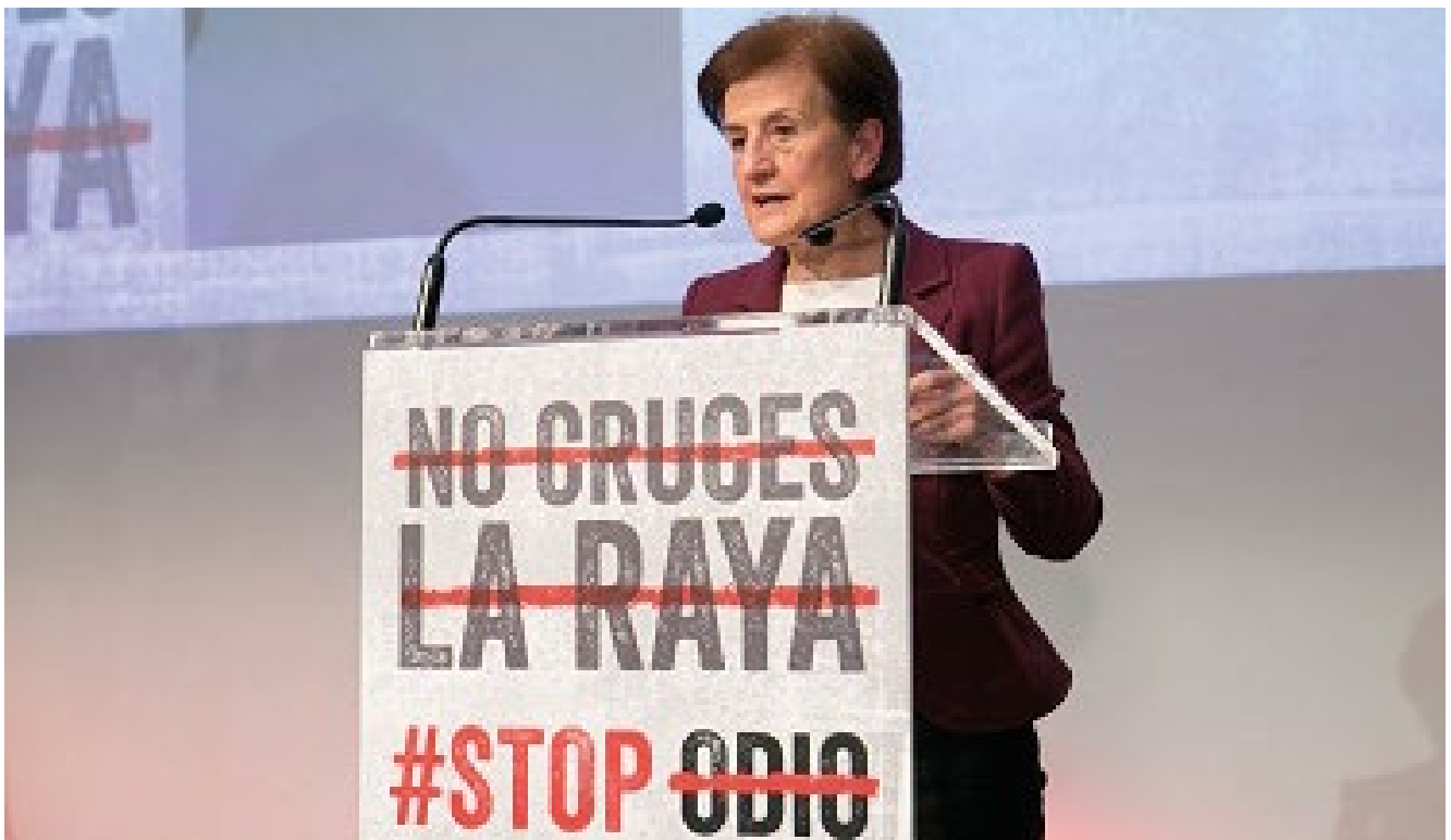
Fig. 2. The philosopher Adela Cortina at the ceremony of the XX edition of the Human Rights Awards. Annual Conference of the Legal Profession 13/12/2018.

ETA, the terrorist organization that has caused the most deaths in Spain, announced its dissolution in 2018. But the risk of terrorist attacks persists, especially due to jihadist terrorism, "a form of global terrorism that mixes religion and politics."