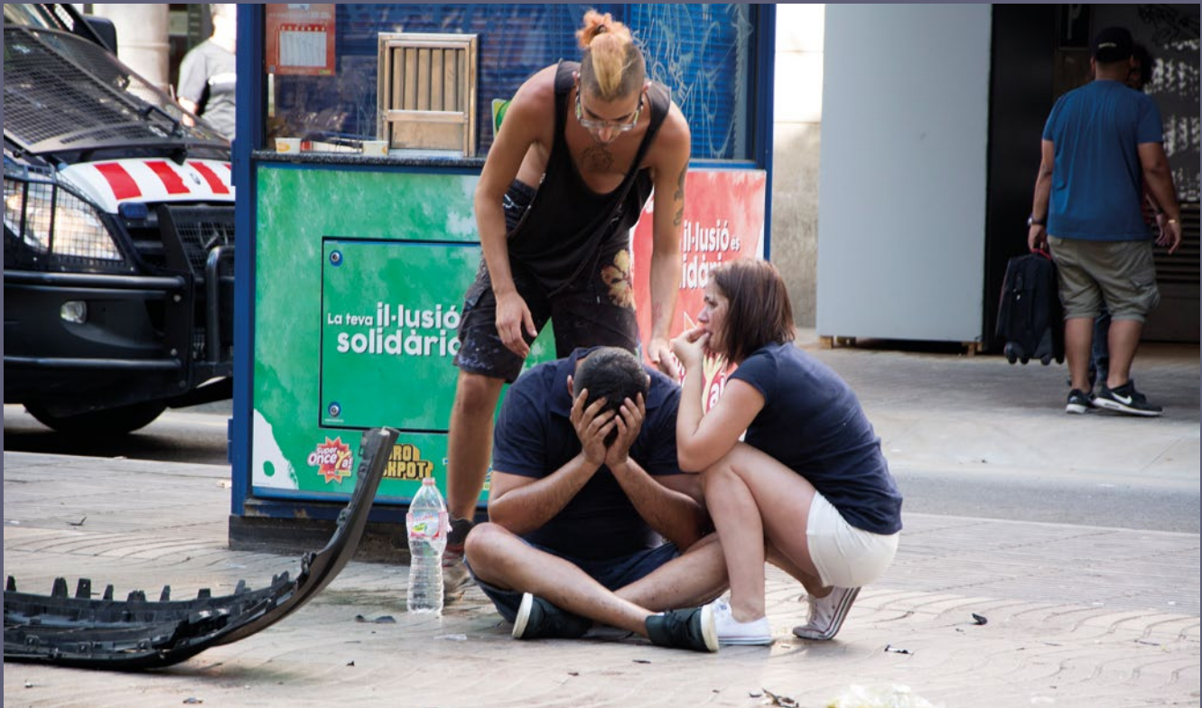
Fig. 3. Young people consoling a victim of a jihadist attack (Barcelona, 17/08/2017).