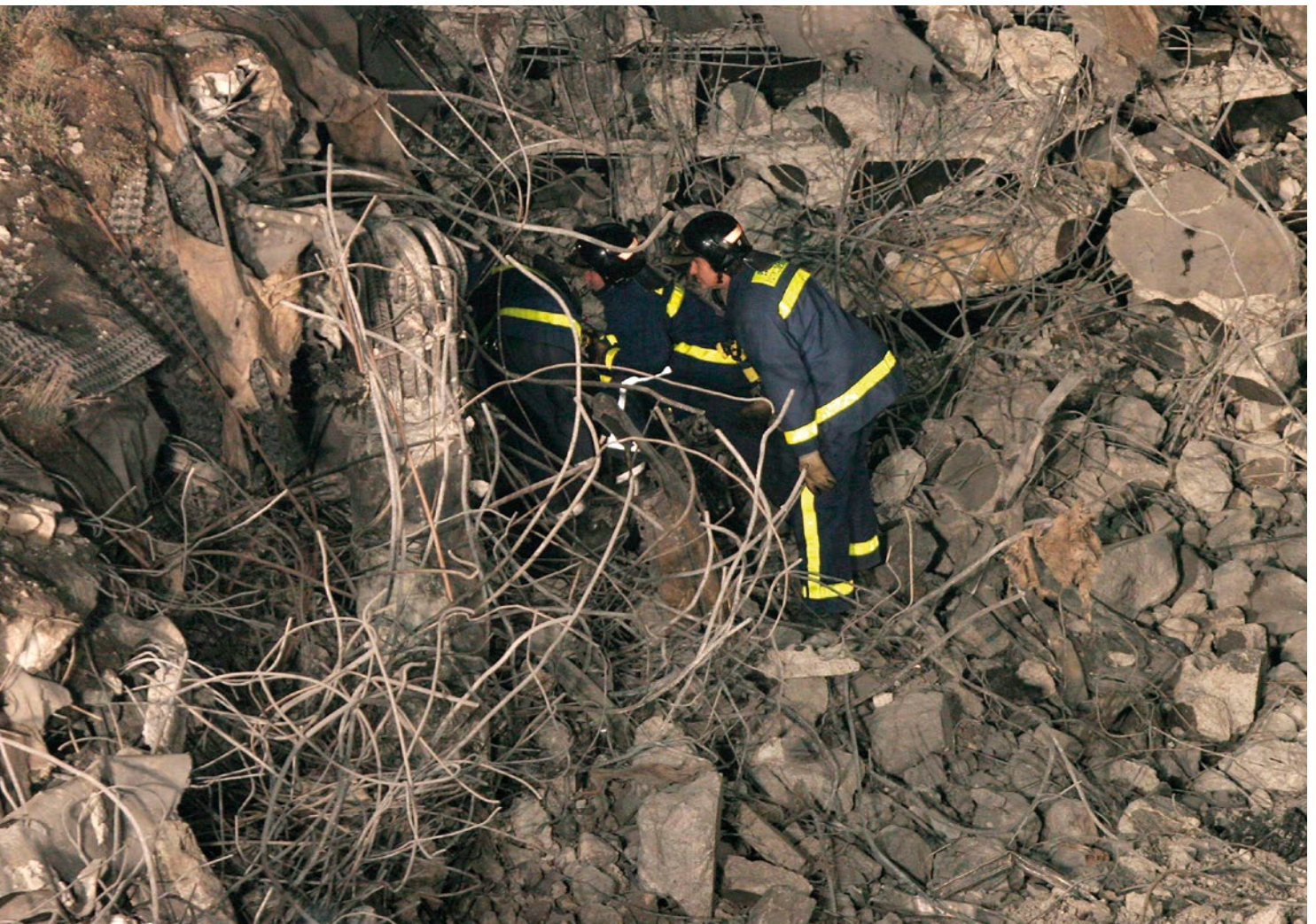
Fig. 6. A group of firefighters inspect the rubble of the car park at terminal T4 of Madrid's Barajas airport, destroyed by an ETA bomb, in their search for two missing people (02/01/2007).