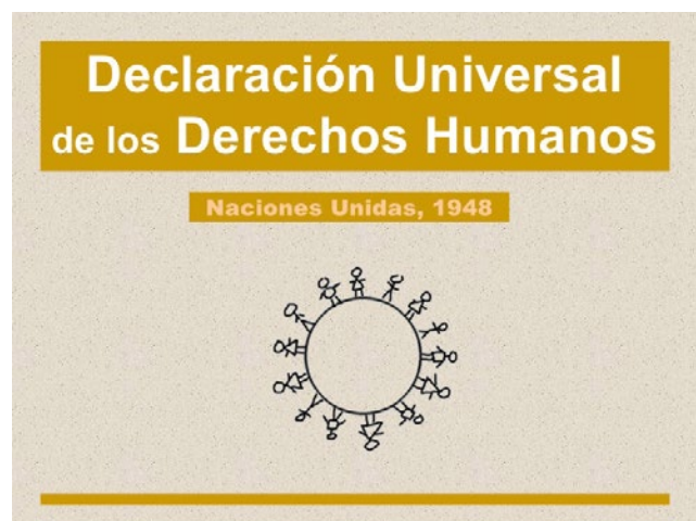
Fig. 1. Cover of the Universal Declaration of Human Rights.

Human Rights can be consulted in the Universal Declaration of Human Rights: https://www.un.org/en/about-us/universal-declaration-of-human-rights